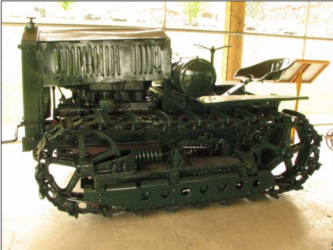
The 1927 Cletrac on display at the Museum in the Park.